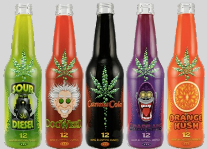
THC-infused sodas currently on the market as of February 2017.